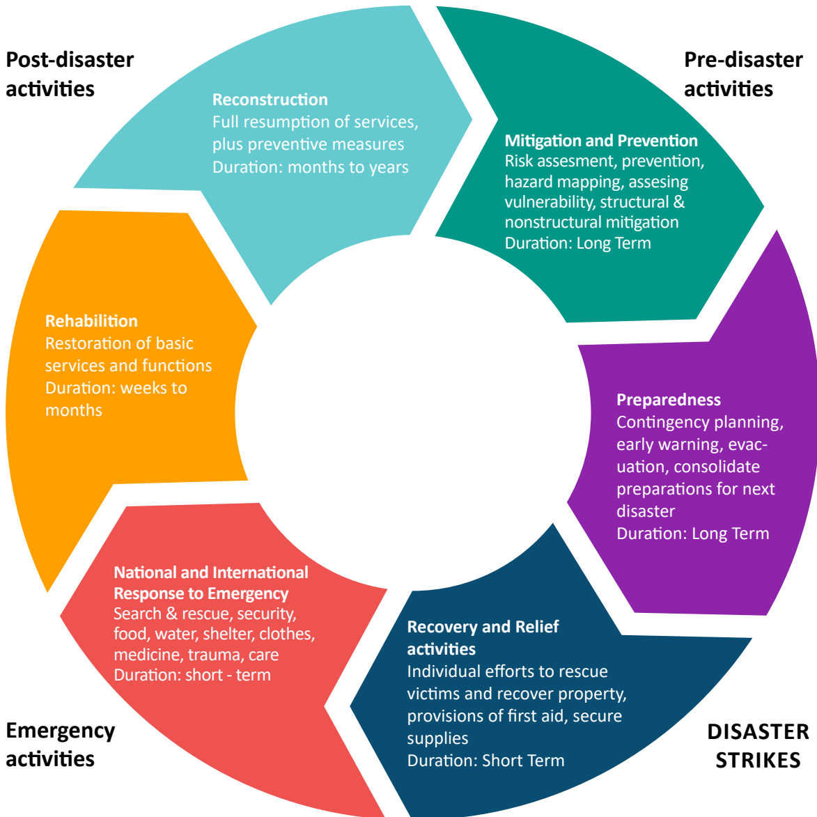
Figure 1: Disaster management cycle showing pre-disaster, disaster occurrence and post-disaster phases